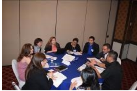
The Workshop on Validation of Documents relating to Migrant Boys, Girls and Adolescents was well attended.